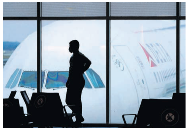
A passenger waits for a Delta Airlines flight at Hartsfield-Jackson International Airport in Atlanta on Feb. 18, 2021.

The agency also asked airlines if they have received complaints about employees or contractors mishandling personal information. Southwest said it discloses in its privacy policy that it "shares certain customer in-